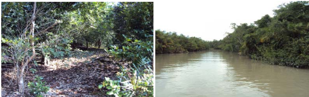
Fig. 3. Shekher Bari (Shekhs' home) on the bank of the river Shibsra and the Shekher Khal (Shekhs' canal).

The archaeological structures of the site are situated inside the dense virgin forests of mixed mangrove species dominated by Sundri ( Heritiera fomes ). The site is rich with a unique biodiversity. The major species of plants that keep these relics hidden inside the forests are Pasur ( Xylocarpus mekongensis ), Bain ( Avicennia officinalis ), Gewa ( Excoecaria agallocha ), Goran ( Ceriops decandra ), Golpatta ( Nypa fruticans ), etc. with some rarely found orchids and climbers. Both sides of the Shekher khal canal bank from the river Shibsra up to the temple side are fenced densely by natural Hental plants ( Phoenix paludosa ) that provide extra scenic beauty to this area (Fig. 3).