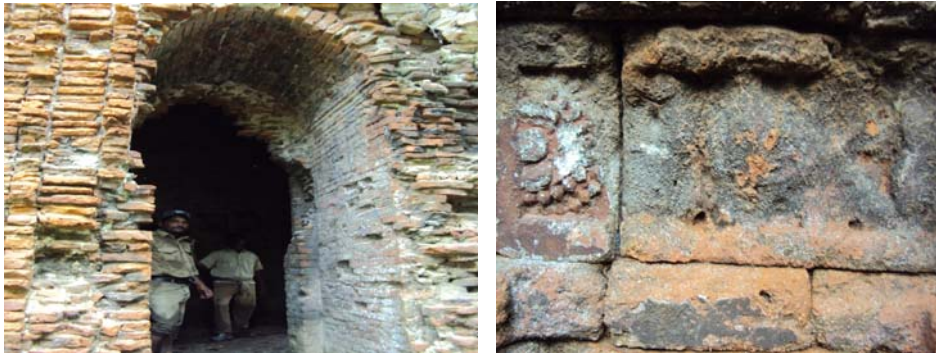
Fig. 2. The entrance point of the ancient Kalir Mandir and the design of the ancient bricks

Sundarbans. Some aboriginal people called the ‘ Kapali ’, living in Jorsing under the area of the Koyra police station of Khulna district are said to be their descendant. Another opinion of the local people is that the miscreants or pyrites inside these forests had been ransomed nearly 600 years ago.