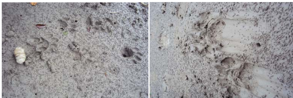
Fig. 4. Pugmarks of a couple of tigers at the Temple site and pug marks while chasing preys

egrets, cormorants, common kingfishers, masked fin-foot and owls can be encountered. Approximately 13.35km 2 of water body in this location that include canals and creeks are abundant with many species of fishes and other aquatic species.