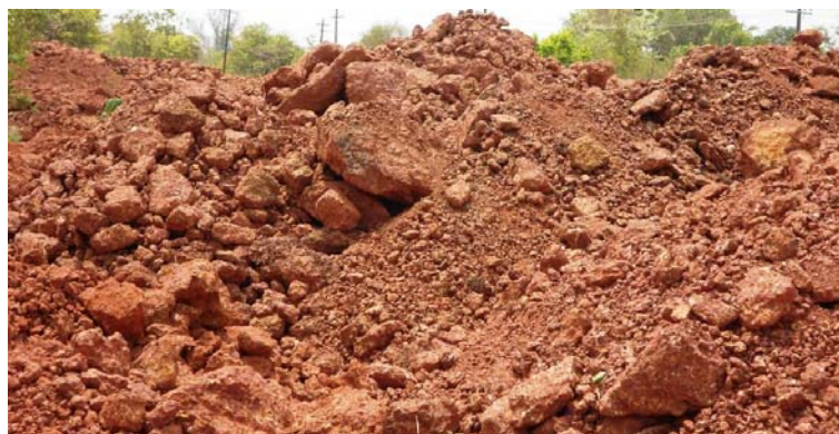
Fig. 3. The photograph showing dumping site of mined lateritic bodies.