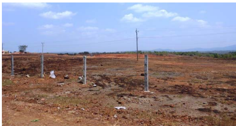
Fig. 2. The photograph showing alumina rich laterite terrain in the Kinanur-Karinthalam transect. The laterite mining area can be seen in the distance.

The alumina rich laterite of Karindalam area (Figs. 2 and 3) is being used as raw materials for the Cement Industries.