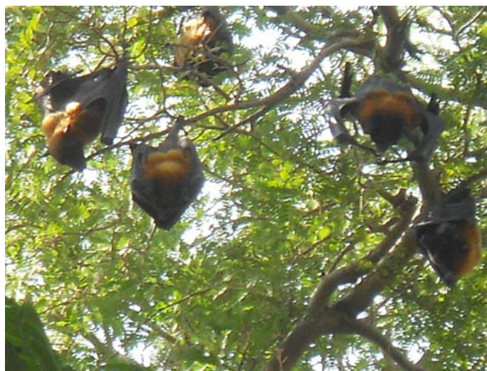
Fig. 3. A colony of Pteropus giganteus giganteus roosting on Vilayati Imly in Jasol

Jasol is twenty kilometer far away from Balotra city. It is a new site of Fruit bat, Pteropus giganteus giganteus roosting on the tree Neem ( Azadiracta Indica ) and Vilayati Imly ( Pithecelobium dulce ). The maximum number i.e 450 was recorded in the month of December 2011.